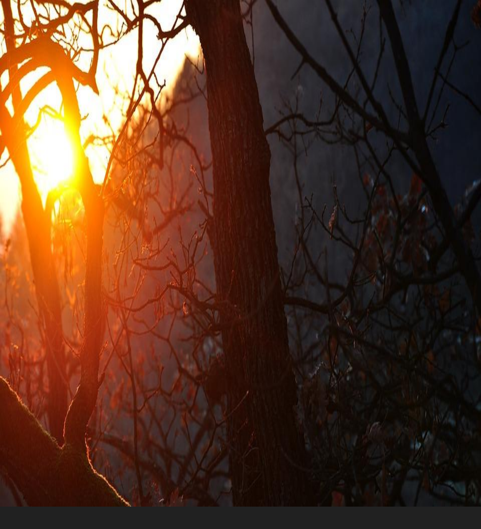
They waited at home.