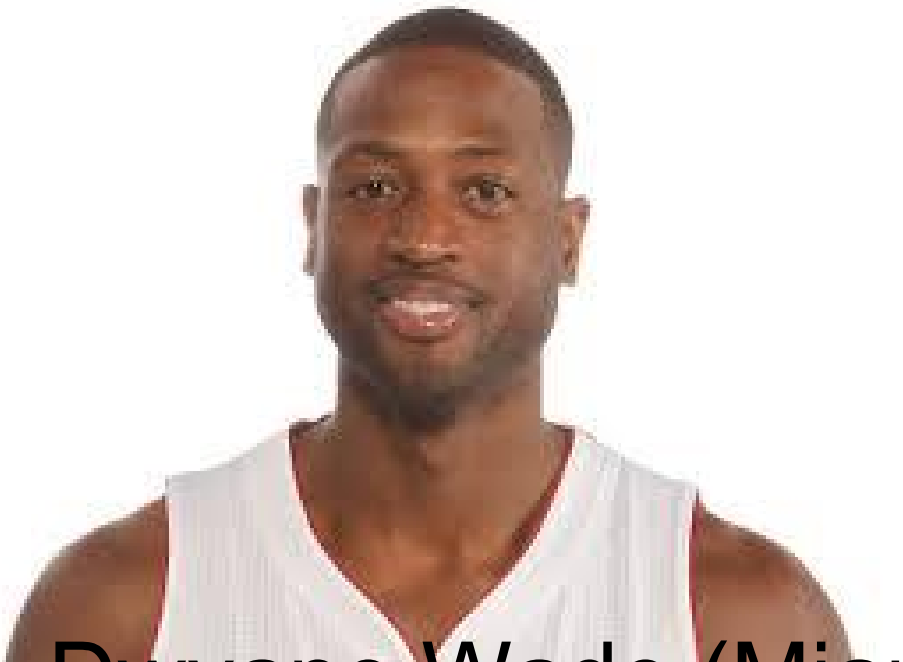
Dwyane Wade (Miami Heat)