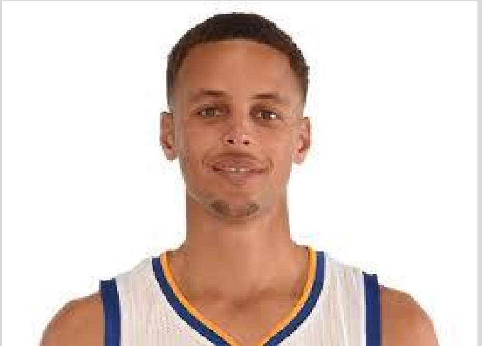
Stephen Curry Golden State Warriors