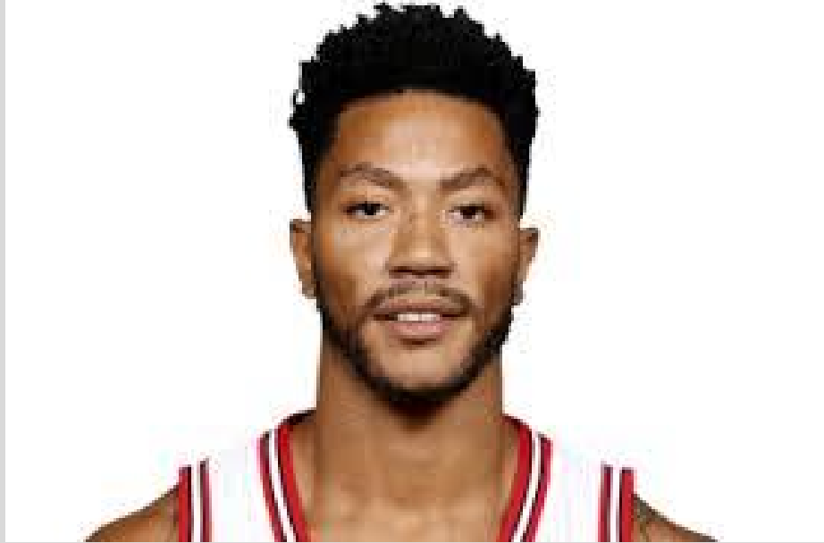
Derrick Rose Chicago Bulls