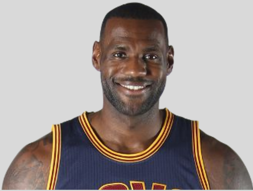
Lebron James Cleveland Cavaliers