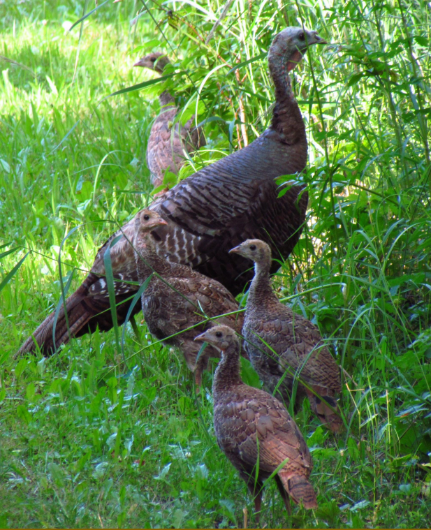
Hen with babies (female)