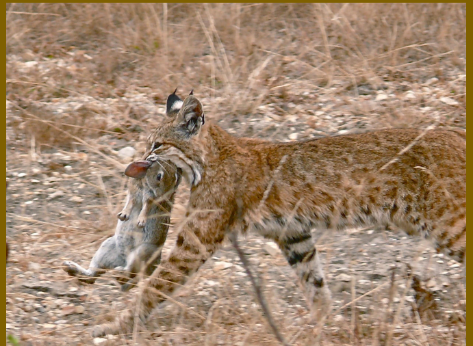
Bobcat with a rabbit