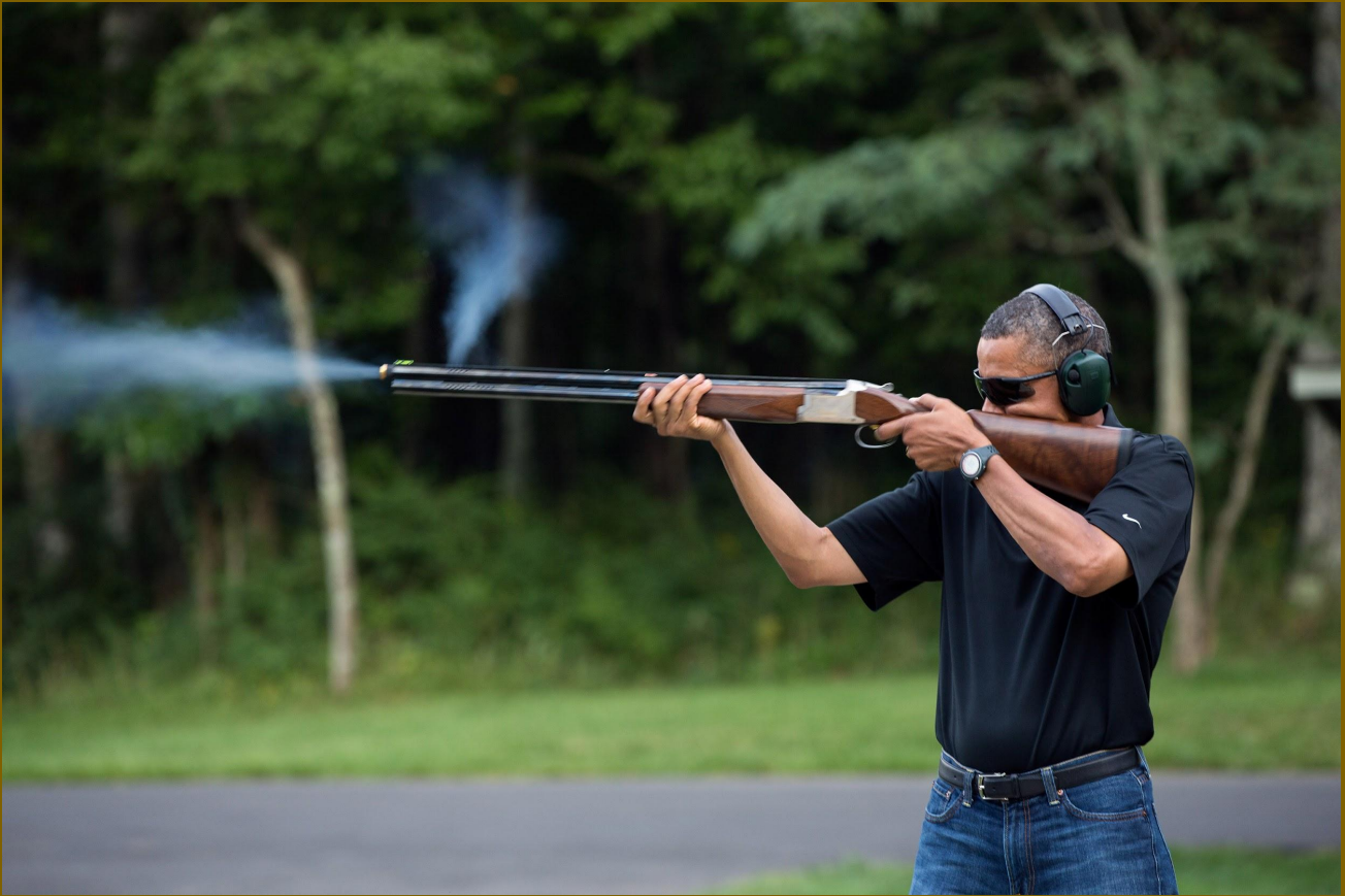
Shooting a shotgun.

You can use as big of a gun as you want for predators. I would recommend a 204 Ruger through a 7mag. If you are calling them in close, you can use a shotgun or a 17 hmr. If you have a good enough scope on a 7mag, you can shoot up to 1,000 yards, that is about 10 football fields.