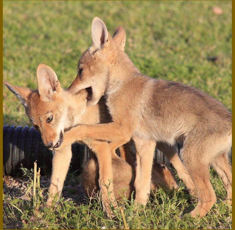
Two Coyote Pups Playing