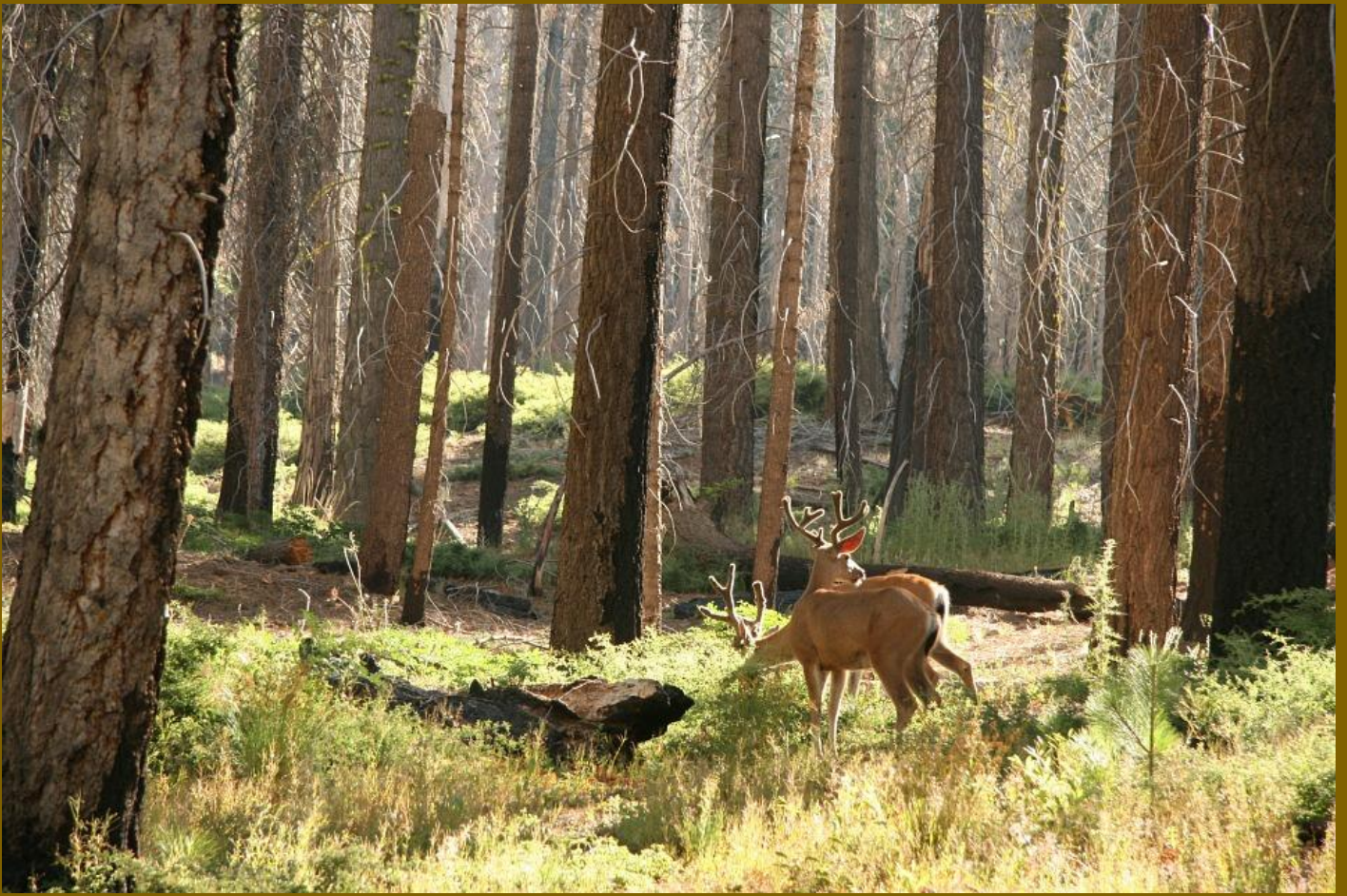
Two male deer.

One of the things you can do in the outdoors is hunting. There are a lot of animals to hunt in southern Illinois. Some of them are deer, turkey, and predators, but there are a lot more. Not just anyone can just go out and start hunting. To be able to go hunting, you have to have a hunting licence. You also have to have a permit to hunt every thing but predators.