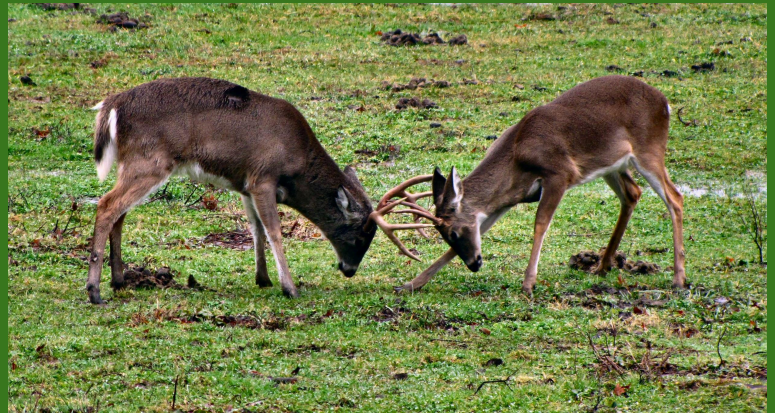
Two Bucks Fighting.