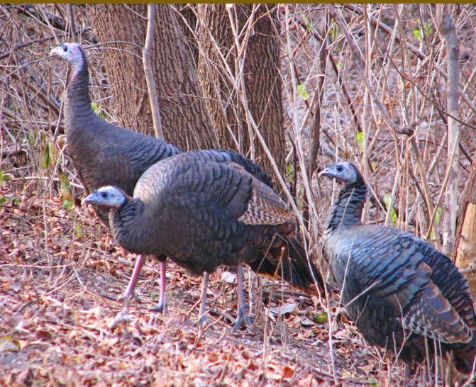
Three Hens walking through the woods