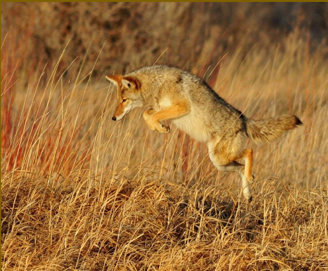
Coyote jumping a fence