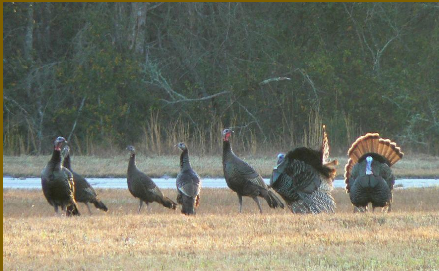
Seven turkeys in a field.